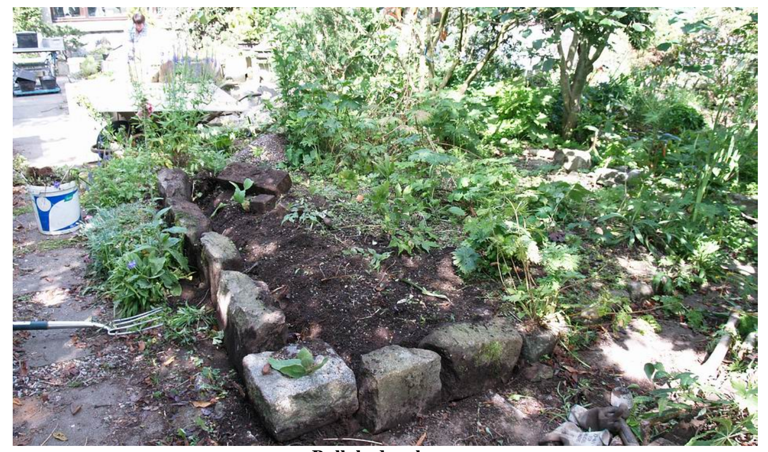
Bulb bed makeover

The leafmould is also interesting as I keep finding areas in the heap which are full of these white fungal fibres. I am convinced that this makes for healthy compost full of friendly fungi that hopefully will help fend off the potentially harmful fungi that can cause rotting and infections in the bulbs.