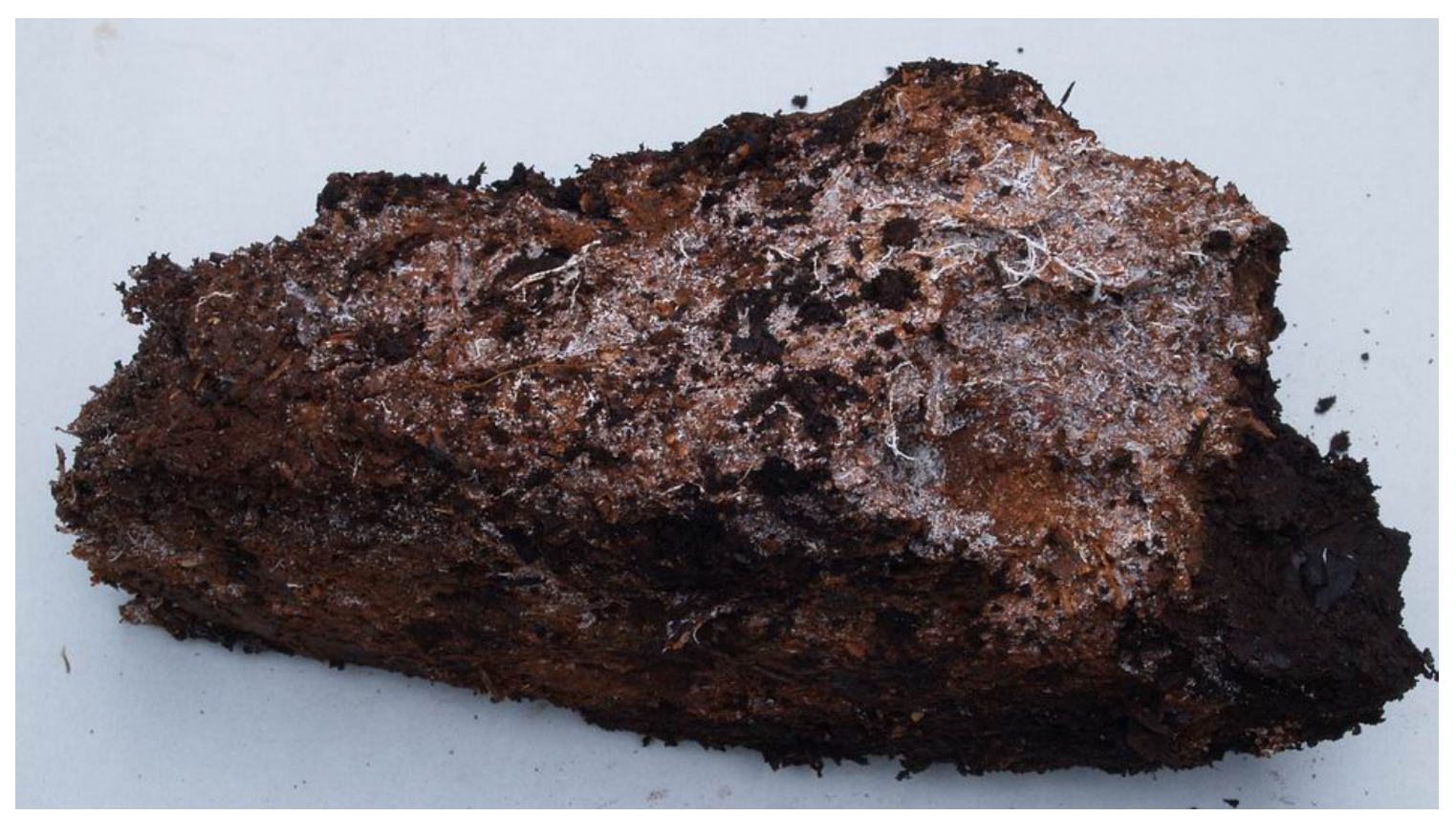
Fugal growth in leaf mould

The leafmould is also interesting as I keep finding areas in the heap which are full of these white fungal fibres. I am convinced that this makes for healthy compost full of friendly fungi that hopefully will help fend off the potentially harmful fungi that can cause rotting and infections in the bulbs.