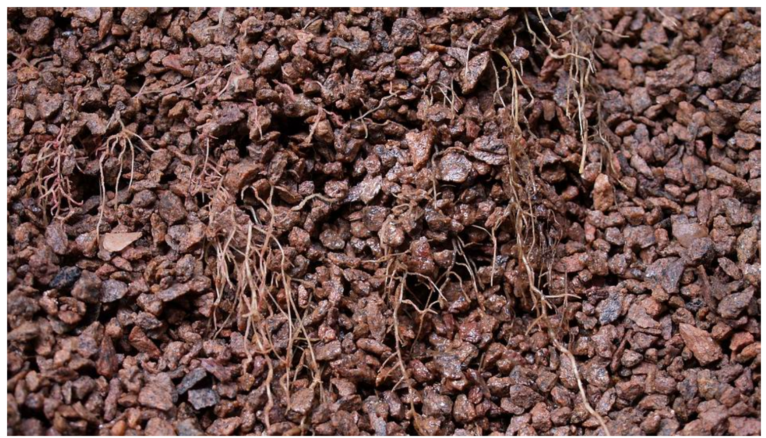
Plant roots in gravel

A number of Fritillarias also like to root early and this includes many of the Chinese species such as Fritillaria cirrhosa. You can see the bulb on the left has already got roots exploring for moisture. In fact with many of these bulbs, if they never dry out, the new roots can start to emerge as the previous season's growth dies back.