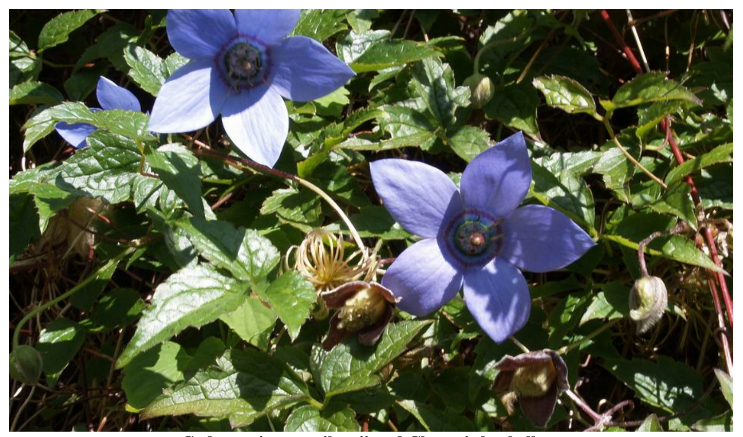
Codonopsis greywilsonii and Clematis barbellata

Codonopsis greywilsonii climbs up through Clematis barbellata which has this year put on a second flush of late flowers as well as the fluffy seed heads from the early spring main flowering.