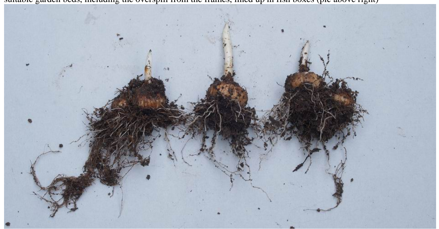
Crocus vallicola corms in growth

cut down the number of plants I have in pots so I hope to plant out as many of these as possible directly into suitable garden beds, including the overspill from the frames, lined up in fish boxes (pic above right)