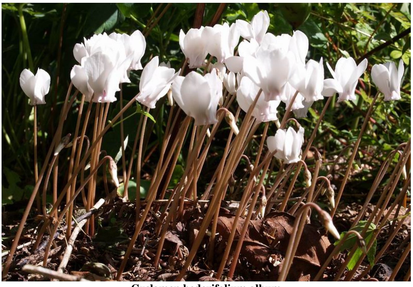
Cyclamen hederifolium album

Now I will show you some of the plants that I picked the flowers in the opening picture from - like the beautifully scented Cyclamen purpurascens; the first Cyclamen to flower for us in the summer.