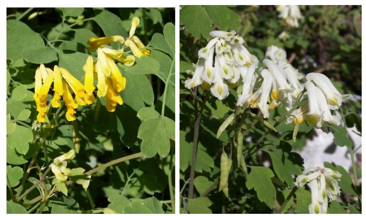
Pseudofumaria lutea and alba

Formerly called Corydalis lutea and C. lutea alba these plants self seed all around. We can easily weed them out when they put themselves where we do not want them to be.