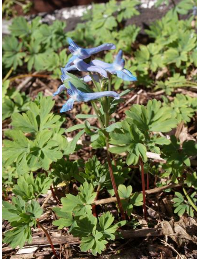
Corydalis hybrid and Corydalis cashmeriana

Corydalis cashmeriana dies back at he end of the spring and grows a new set of leaves in late summer often accompanied by some rather purple blue flowers as can be seen above - nothing like the striking colour of the spring flowering. This new growth has appeared early most likely due to our particularly wet July weather.