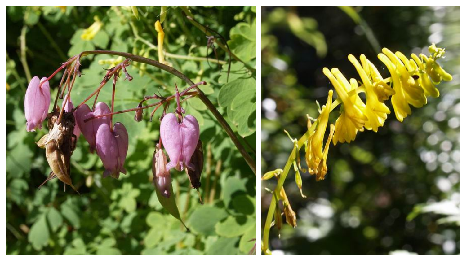
Dicentra formosa and Corydalis species

Some late flowers on a Dicentra formosa that is growing in cool moist shade and a yellow Corydalis species collected many years ago in the Himalaya by Alastair McKelvie.