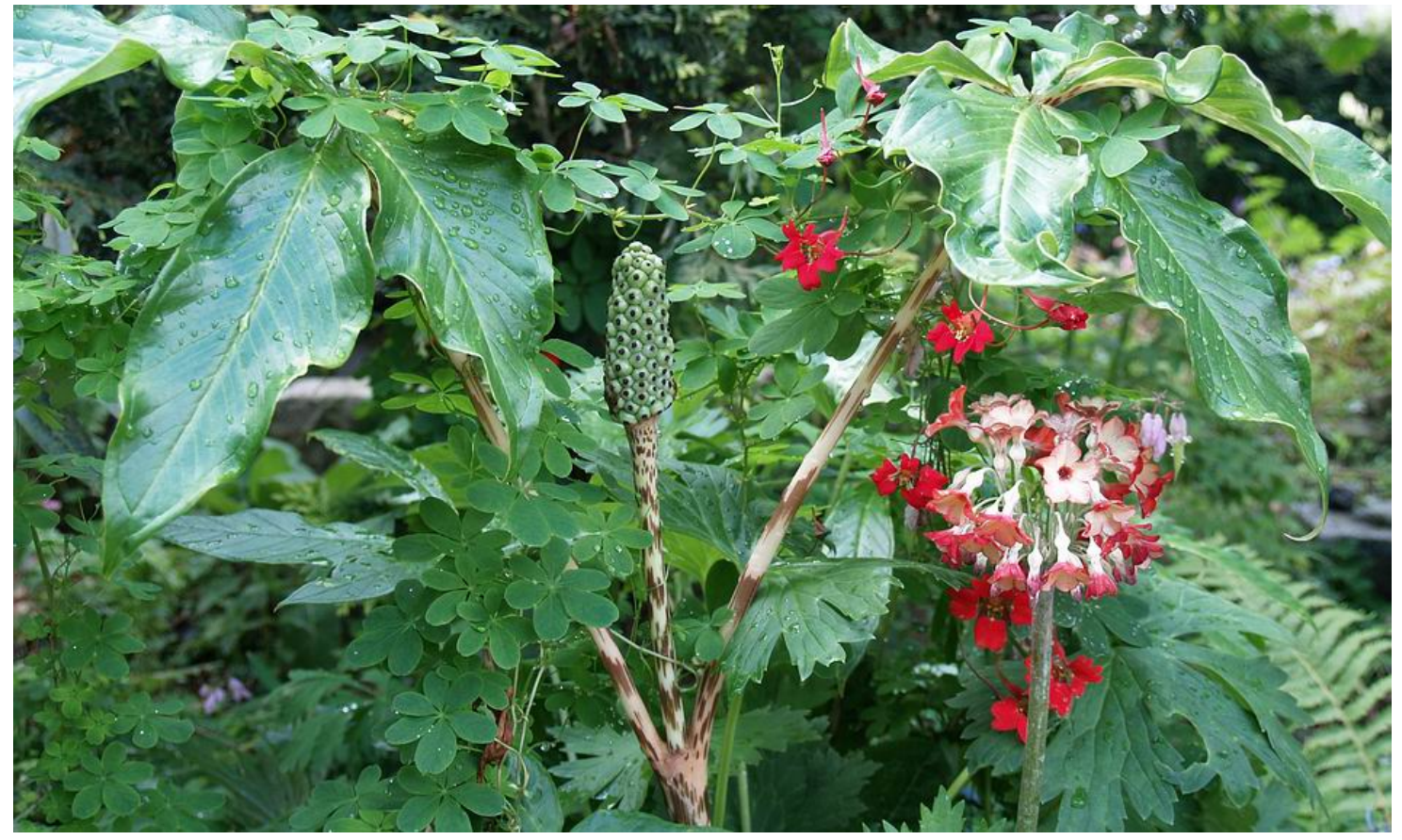
Arisaema nepenthoides Primula florindae and Tropaeolum speciosum

I should point out that not every pot that I go into is full of healthy bulbs – I have plenty of failures and problems as well; like these crocus corms that have rotted away. I do get upset when I lose any plant but I always try to be positive and work out why I lost it so that I can make any necessary correction to better succeed in the future.